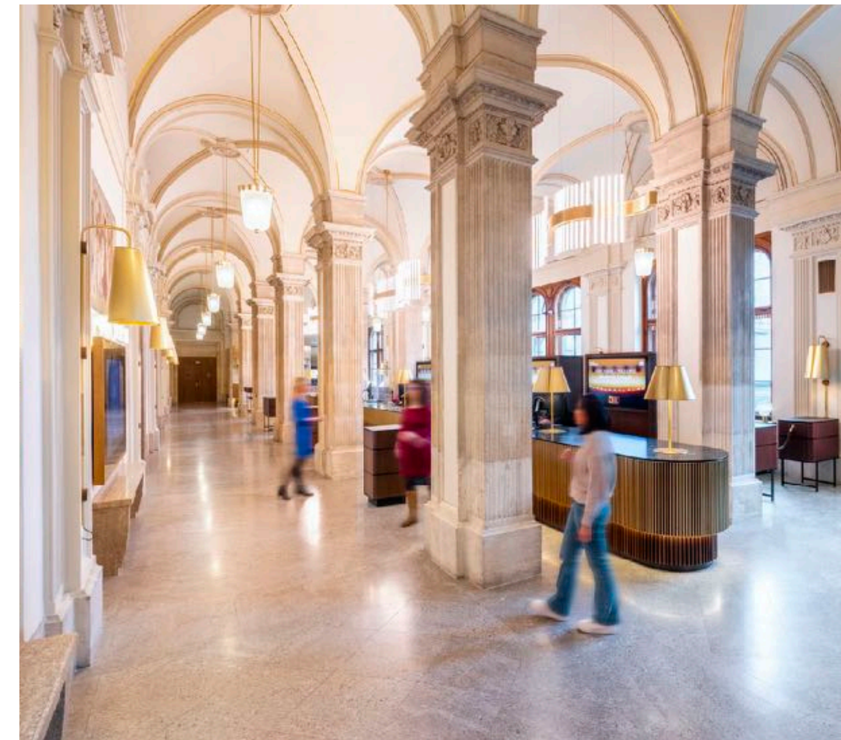
Papyrus Museum ▾