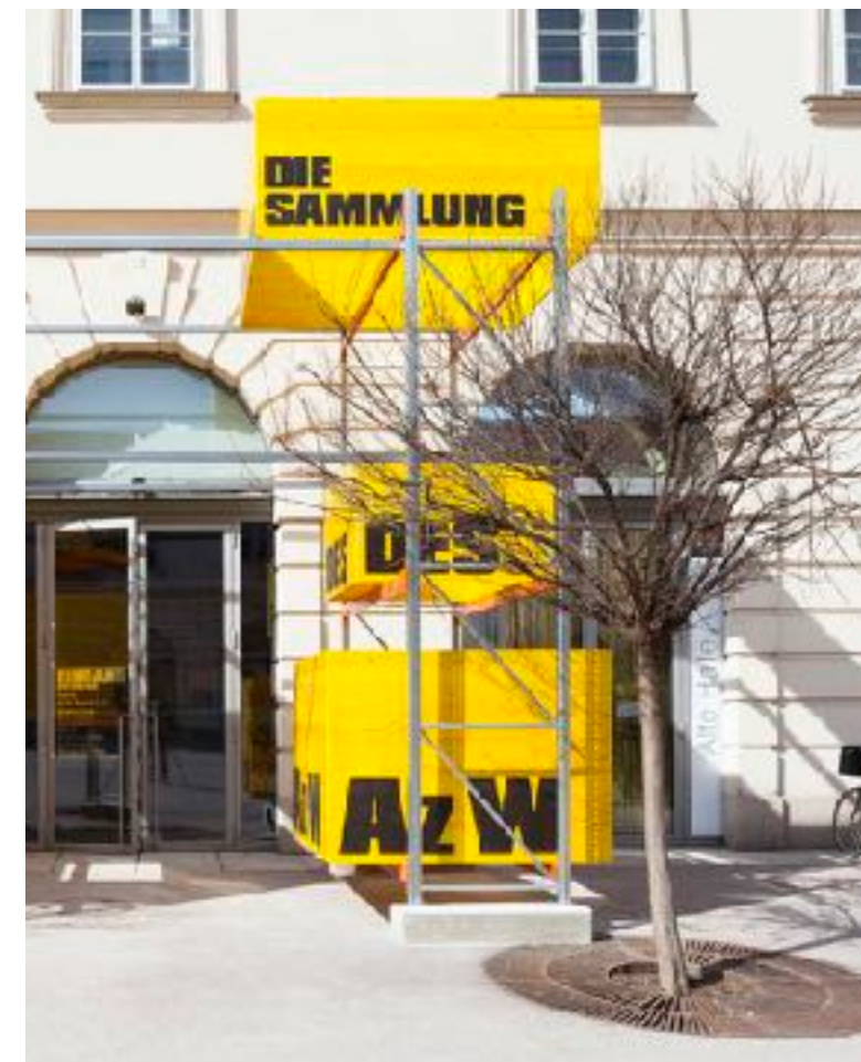
Az W Gold. The Collection ▾