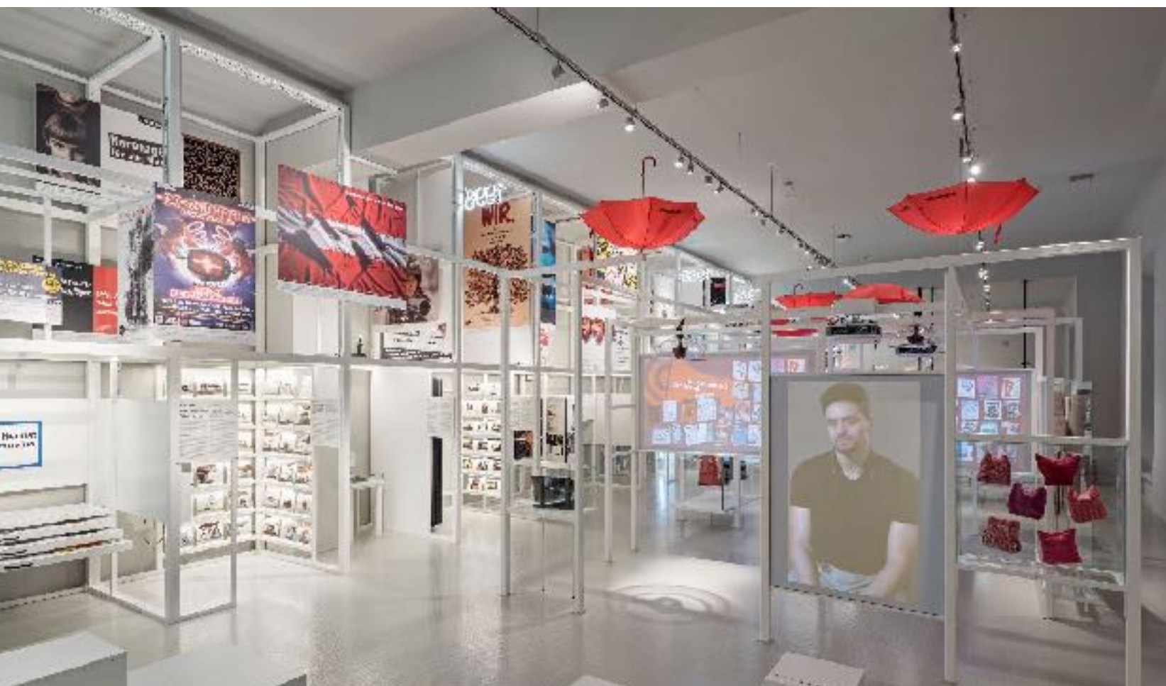
Museum for Austrian Literature ▾