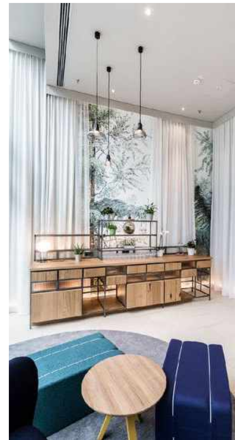
△ Courtyard by Marriott Vienna Prater/Messe